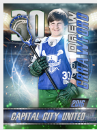
A. Game Day