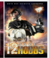
NEW E. Heroic