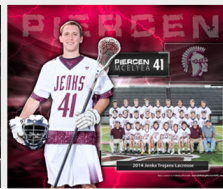
D. Team Fusion